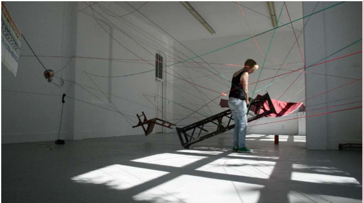
Frame of making composition 4b, may 25 2017