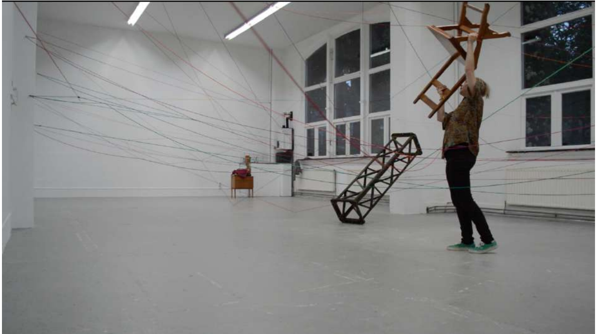
Frame of composition 4a, may 22 2017

Confronted with "What to do?" in his studio soon after graduating, Bruce Nauman had the simple but profound realization that "If I was an artist and I was in the studio, then whatever I was doing in the studio must be art. At this point art became more of an activity and less of a product." (Wikipedia)